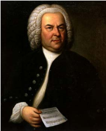
Bach in a 1748 portrait by Hausmann

It gives me great pleasure to write about our upcoming 2010 17th Bach festival. We will have four concerts in our Grace Church Bach Festival this year. The American Guild of Organists (“AGO”) National Convention will be here in Washington, DC, from July 5 - 8, and this time has traditionally in past years, been part of the dates for our Bach Festival concerts. There are 2,200 organists pre-registered for the convention, and our Bach Festival agenda has been on the AGO website as pre- and post-convention events since January, 2010.